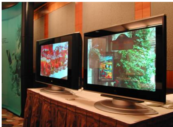
Fig. 2. 34-inch inorganic electroluminescent display.